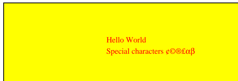
Figure 11-1: 'Hello World'

This will produce a PDF file containing the following graphic: