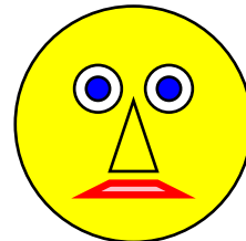
Figure 11-19: A sample widget

>>> from reportlab.lib import colors >>> from reportlab.graphics import shapes >>> from reportlab.graphics import widgetbase >>> from reportlab.graphics import renderPDF >>> d = shapes.Drawing(200, 100) >>> f = widgetbase.Face() >>> f.skinColor = colors.yellow >>> f.mood = "sad" >>> d.add(f) >>> renderPDF.drawToFile(d, 'face.pdf', 'A Face')