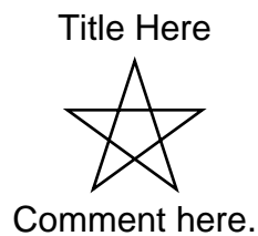
Figure 2-21: line style parameters

The star function has been designed to be useful in illustrating various line style parameters supported by pdfgen.