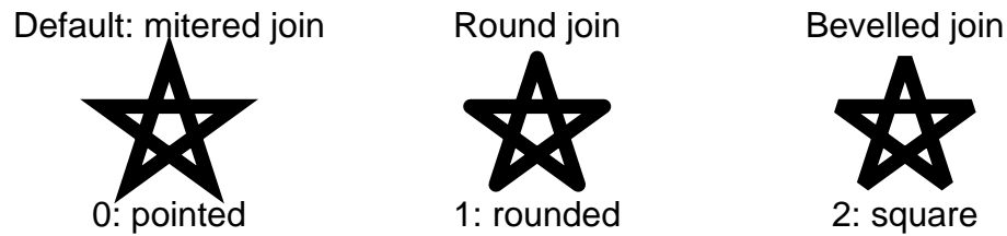
Figure 2-22: different line join styles