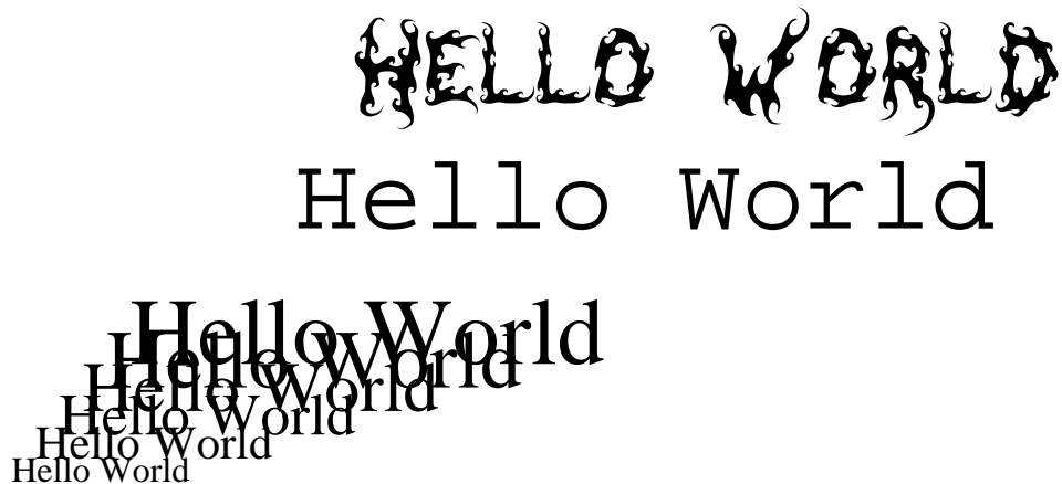
Figure 11-17: fancy font example